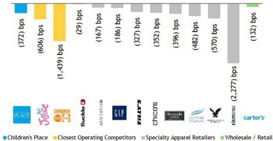
EBITDA Margin Δ 2010-2014

The arbitrary use by ISS of Carter's as the sole operating comparison is a direct reflection of Macellum and Barington's cherry picking and slight-of-hand statistics to present an inaccurate picture of the facts.